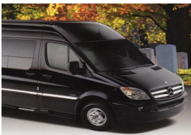
Sprinter Family Limousine