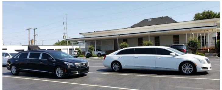
Black or White Funeral Sedan