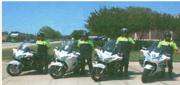
Fort Worth Motor Escorts