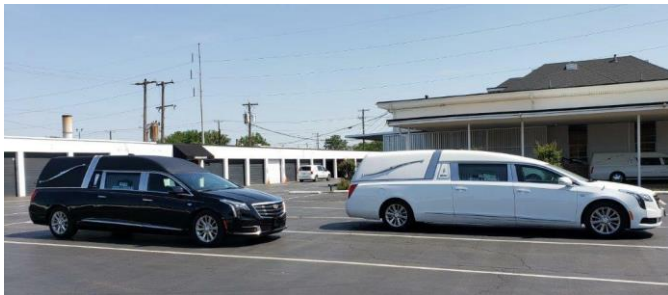
Black or White Funeral Coach

Outside charges such as Flowers, Newspaper Obituary and Cemetery are to be added per family request.