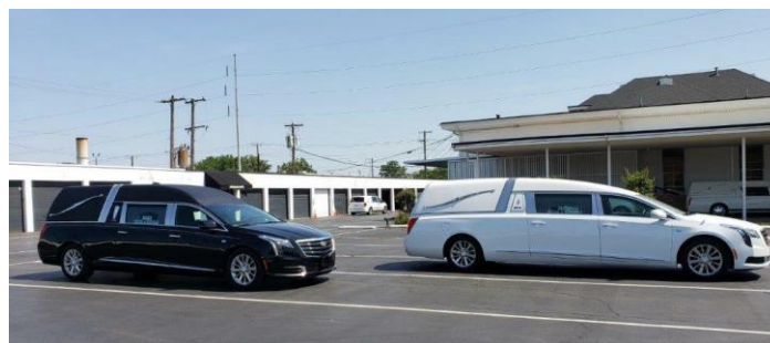
Black or White Funeral Coach

Outside charges such as Flowers, Newspaper Obituary and Cemetery are to be added per family request.