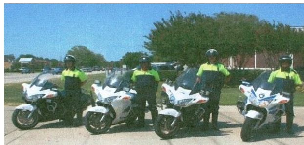
Fort Worth Motor Escorts