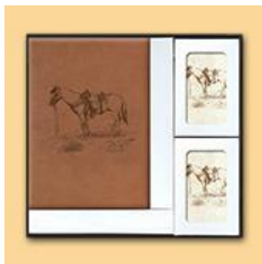
Register Book Package