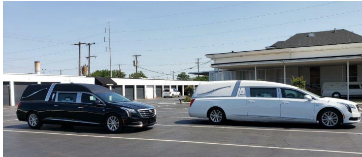
Black or White Funeral Coach