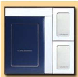
Register Book Package

Outside charges such as Flowers, Newspaper Obituary and Cemetery are to be added per family request.